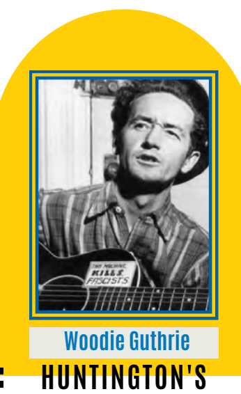
ABOUT THE HUNTINGTON'S DISEASE SOCIETY OF AMERICA

The Huntington's Disease Society of America (HDSA) is the premier nonprofit organization dedicated to improving the lives of everyone affected by Huntington's disease. From community services and education to advocacy and research, HDSA is the world's leader in providing <a href="https://example.com/help-nonprom/">help for today, hope for tomorrow</a> for people with Huntington's disease and their families.